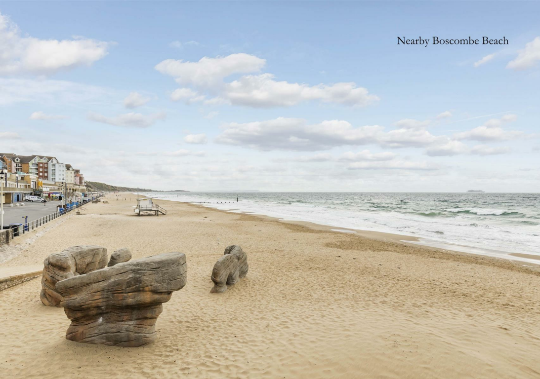
Nearby Boscombe Beach