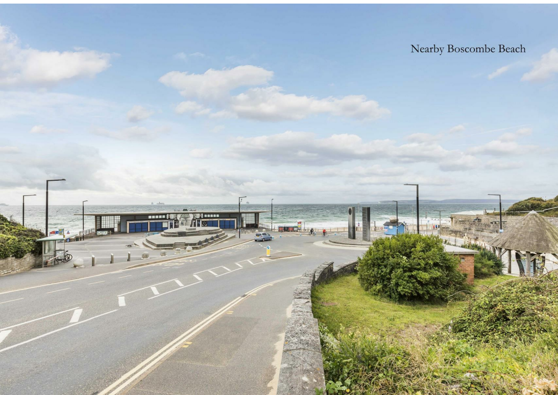
Nearby Boscombe Beach