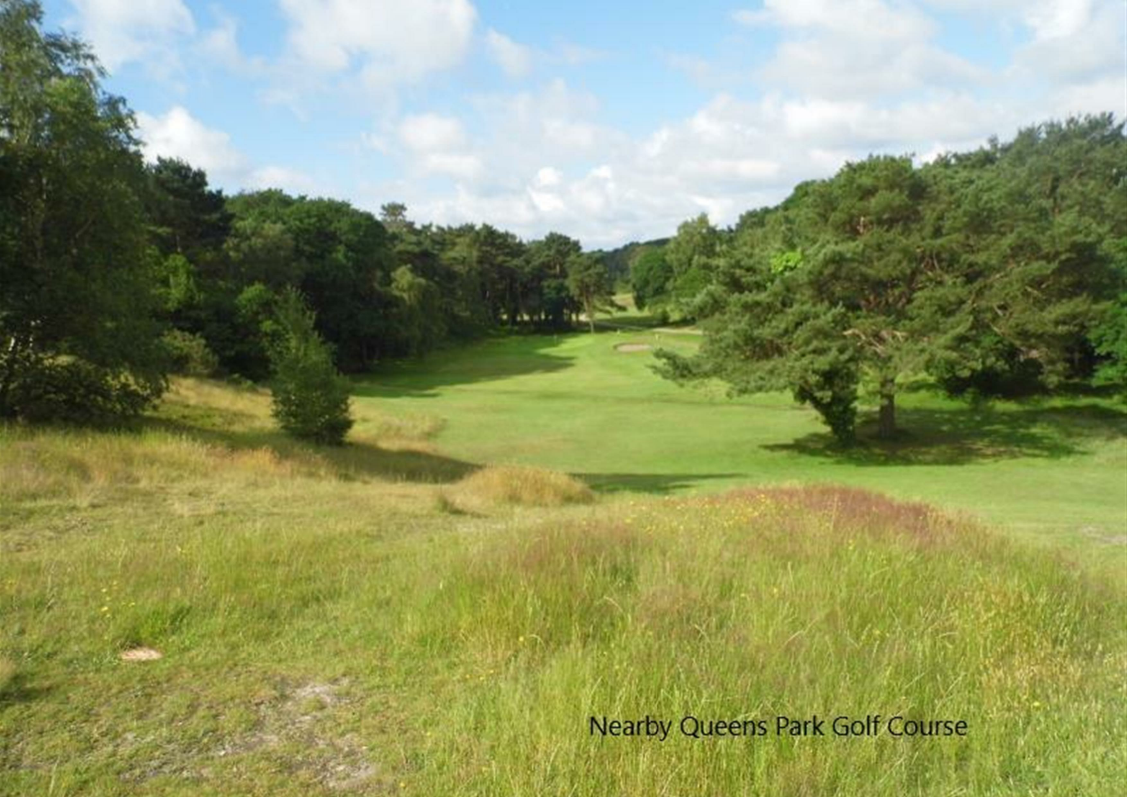
Nearby Queens Park Golf Course